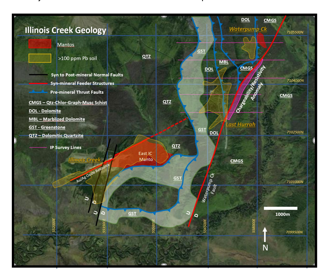
Figure 2 is a preliminary geologic map of the Illinois Creek property and shows the development of major manto-form mineralization proxied by Pb soil values at or adjacent to two major syn-mineral structures, the Illinois Creek fault and the Waterpump creek fault, and a series of major thrust surfaces shown in blue on the map.

LH21-01 drilled this year to the east on line 7103250N to test that chargeability (IP) and resistivity deviated down the footwall side of the fault but did not intersect the structure. Drill core showed numerous thin gossan zones, fugitive calcite and further defined the marble thrust plate which overlies manto-form mineralization at Last Hurrah. LH21-02 was subsequently collared 250 meters east of LH21-01 and drilled steeply west to approximately 200 meters depth. The drill hole was terminated in the overlying marble thrust plate due to adverse weather conditions in October but will be re-entered and completed as the initial test of the structure and IP/resistivity anomaly in 2022.